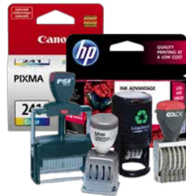
COMPUTER ACCESSORIES & RUBBER STAMP